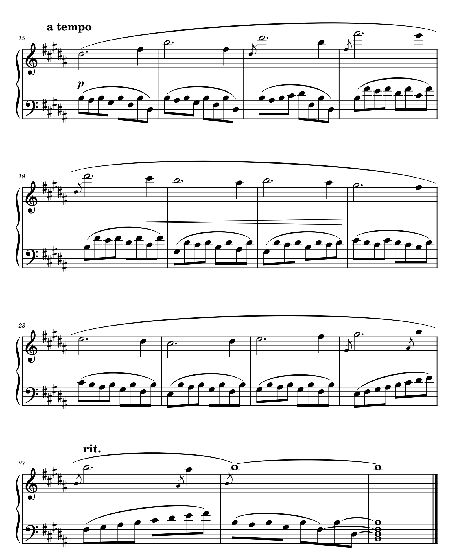
Play with a sense of hesitation, as if you don't quite know where it's going!